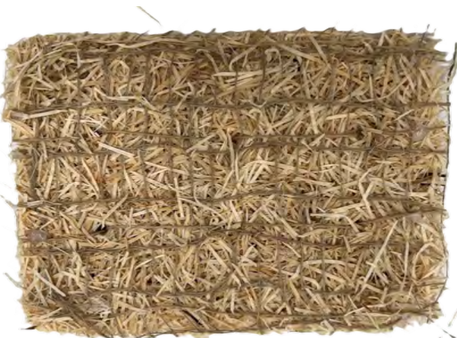
Greenfix® wood fibre blankets with jute nettings